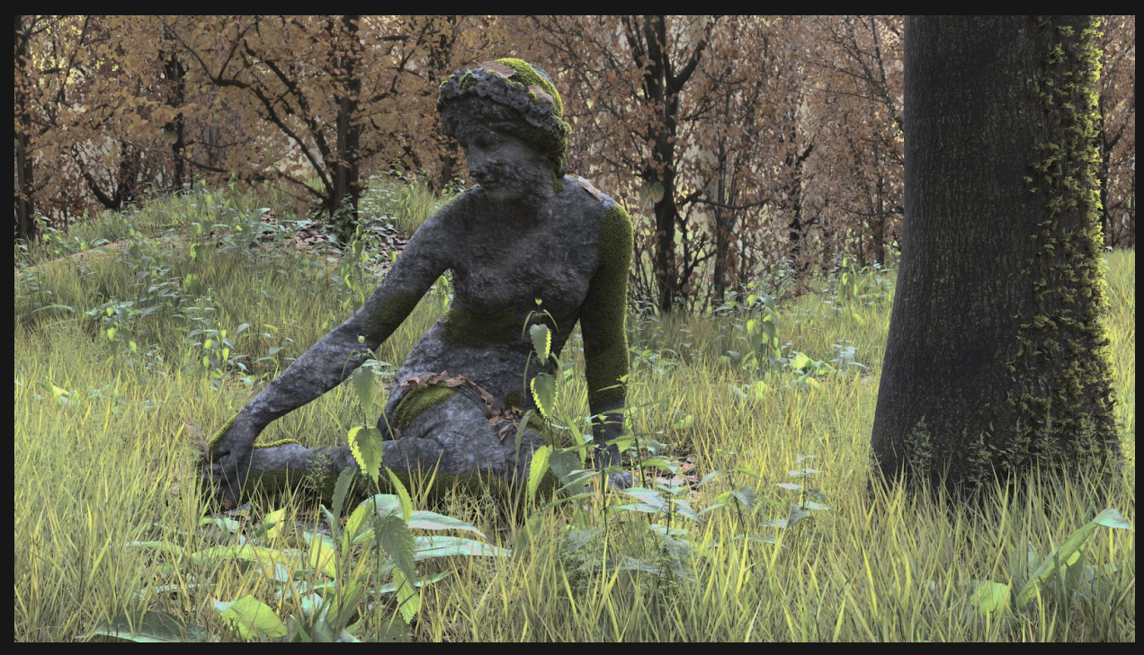
I found this awesome website with very high-quality 3d scans of statues. http://threedscans.com

The challenge was to work with grass and make it as realistic as possible.