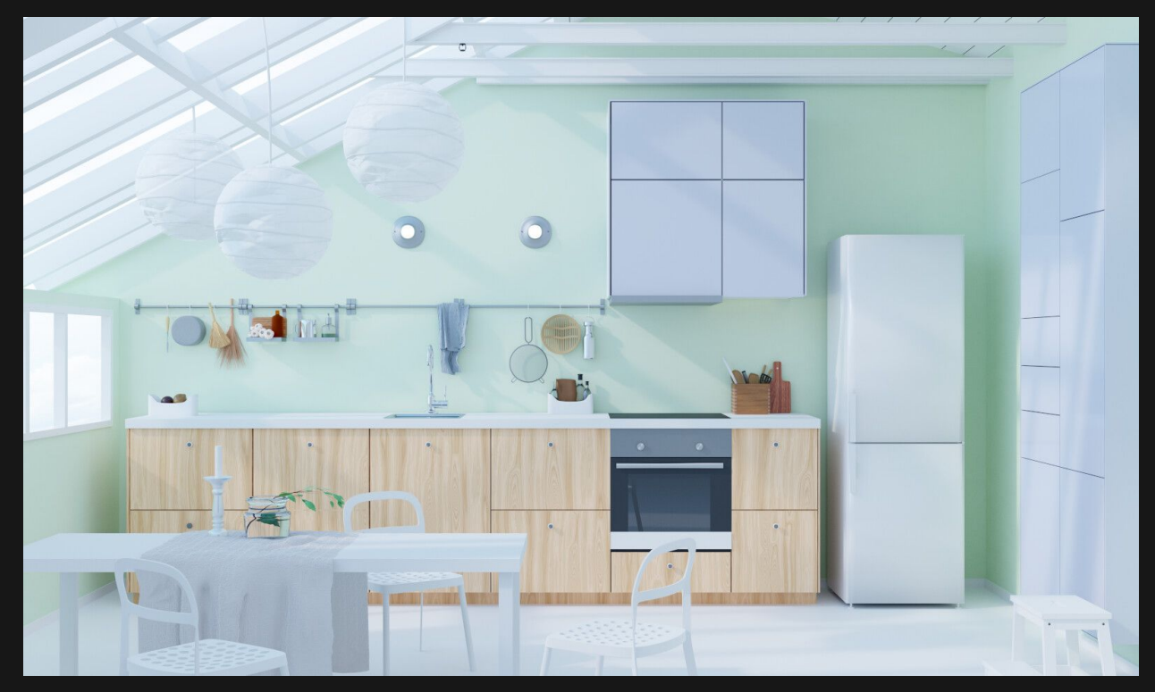
Ikea kitchen from an Ikea catalogue.