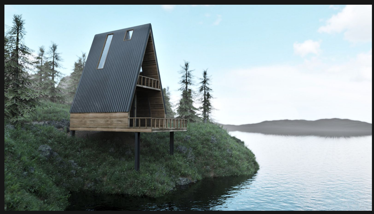
Inspired by a A shape cabin made by https://www.madihome.com/ with my own twist on the cabin. I am currently working on animating the water: <u>click here for the video</u>