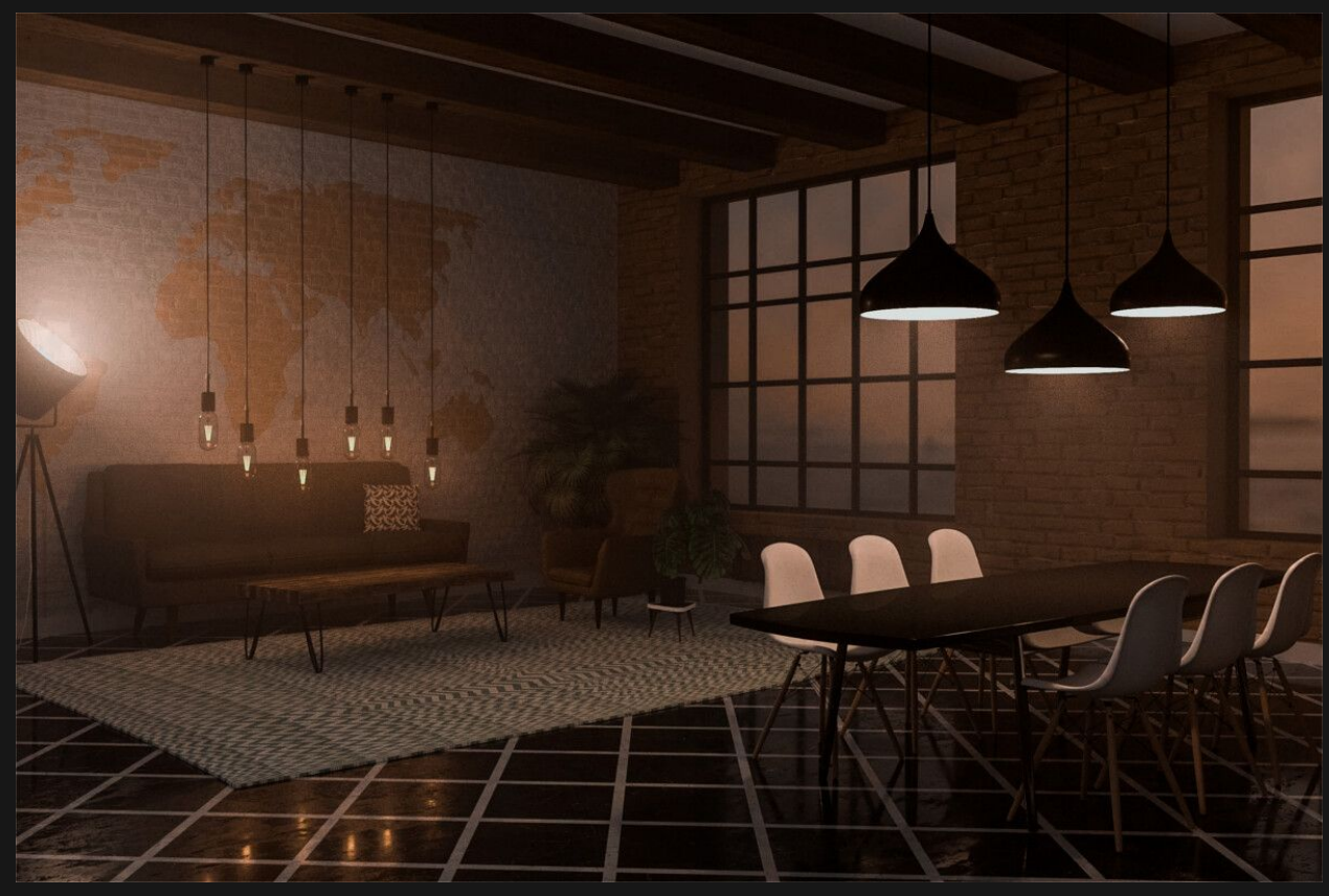
The purpose of this scene was to study volumetric lighting.